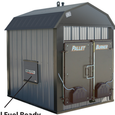
Dual Fuel Ready