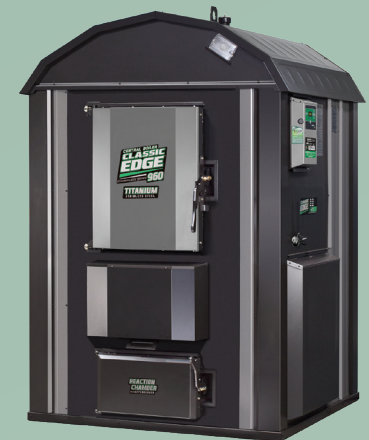
CLASSIC EDGE 960 TITANIUM HDX

Furnace Options and Accessories: • LED Light Kits