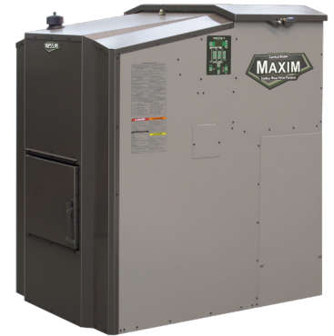
The Maxim M255 PE is U.S. EPA Step 2 Certified.

Freedom to do more - With a Maxim outdoor wood pellet furnace, you'll have more time because of the large integrated hopper and extended burn times.