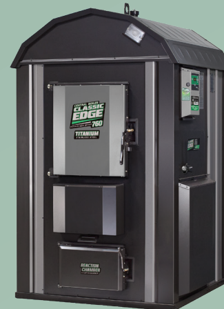
CLASSIC EDGE 760 TITANIUM HDX

Furnace Options and Accessories: • LED Light Kits • Pump Panel Extension Kit