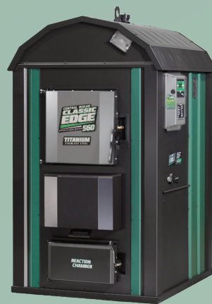
CLASSIC EDGE 560 TITANIUM HDX

Furnace Options and Accessories: • LED Light Kits • Pump Panel Extension Kit