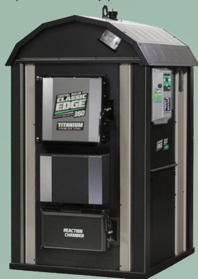
CLASSIC EDGE 360 TITANIUM HDX

See back page for financing details and other important information.